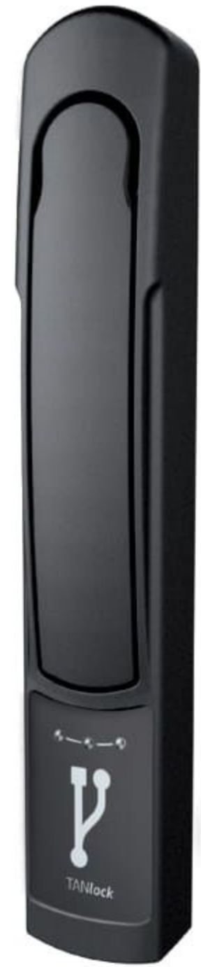
YOUR TANlock 3